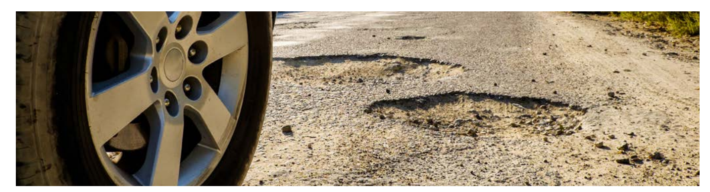
Troubles at low speed

In our analogy we said that the faster your car is going the bigger the jolt. Conversely, slowly driving over a pothole will cause little jolt at all. In the equation if you travel over the same pothole at ever increasing speeds the jolt you will feel becomes stronger the faster you travel.